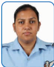
KAVITA BARALA (First Women Navigator of India)